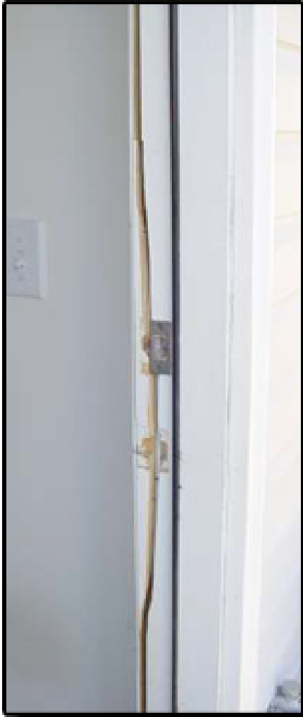
Customer's door kicked in